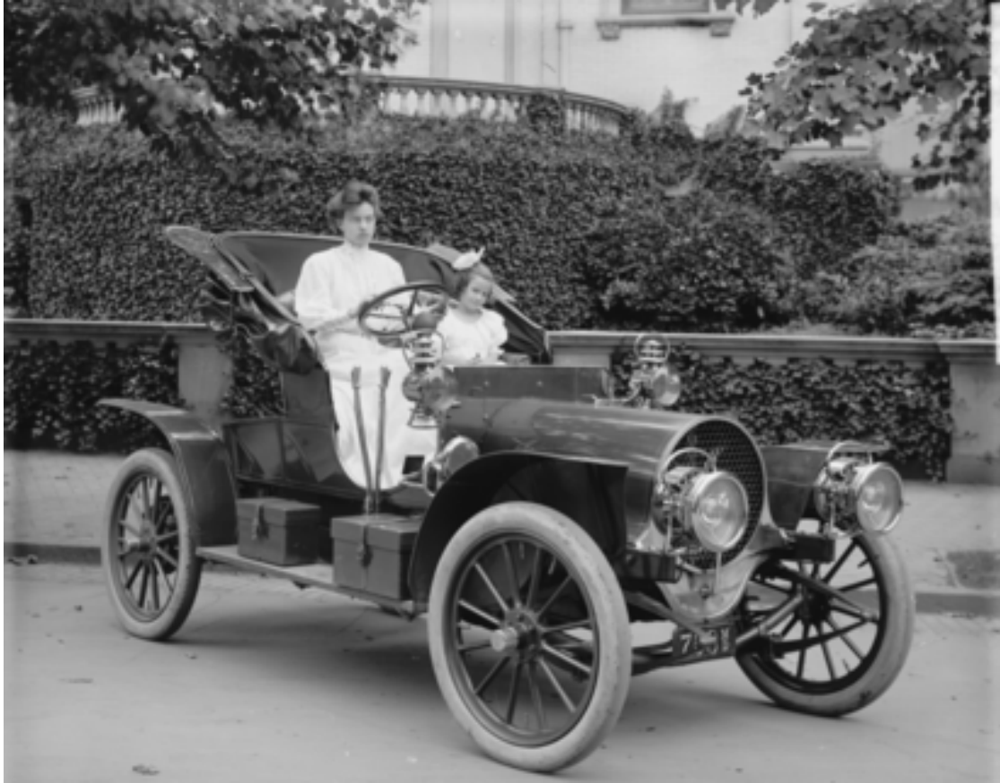
Figure 1: 1907 Franklin Model D roadster.