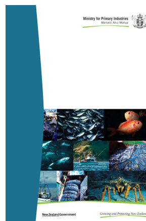
(b) Cover of an Aquatic Environment and Biodiversity Report (AEBR).