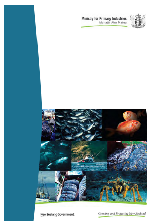
(a) Cover of a Fisheries Assessment Report (FAR).

Nam dui ligula, fringilla a, euismod sodales, sollicitudin vel, wisi. Morbi auctor lorem non justo. Nam lacus libero, pretium at, lobortis vitae, ultricies et, tellus. Donec aliquet, tortor sed accumsan bibendum, erat ligula aliquet magna, vitae ornare odio metus a mi. Morbi ac orci et nisl hendrerit mollis. Suspendisse ut massa. Cras nec ante. Pellentesque a nulla. Cum sociis natoque penatibus et magnis dis parturient montes, nascetur ridiculus mus. Aliquam tincidunt urna. Nulla ullamcorper vestibulum turpis. Pellentesque cursus luctus mauris.