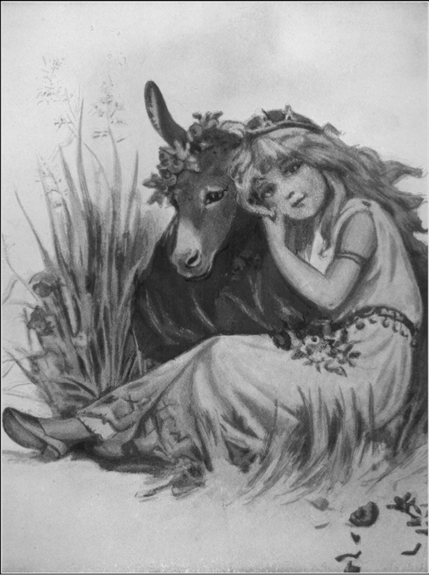
TITANIA AND THE CLOWN