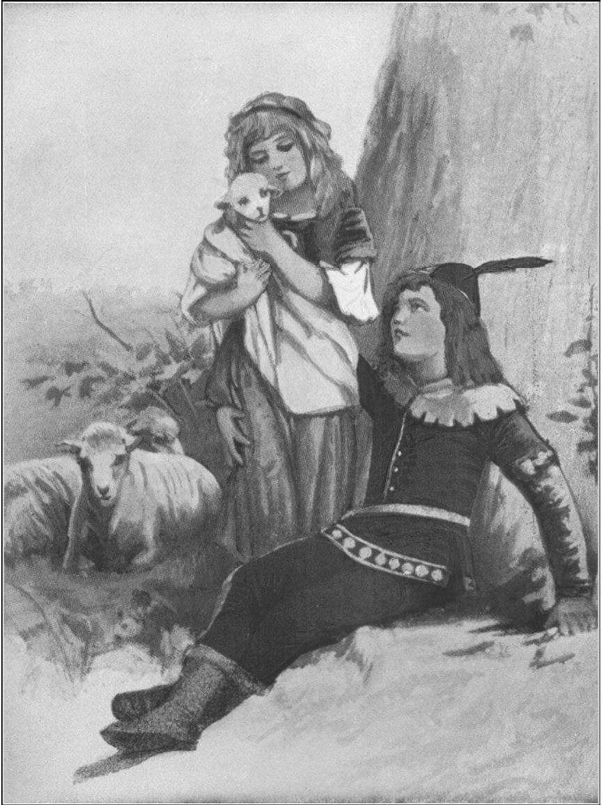
PRINCE FLORIZEL AND PERDITA