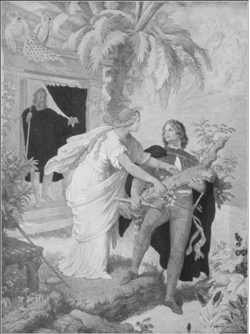
FERDINAND AND MIRANDA