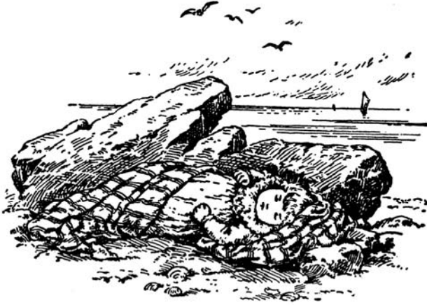
LEFT ON THE SEA-COAST

The shepherd, being a kind-hearted man, took home the little baby to his wife, and they brought it up as their own child. She had no more teaching than a shepherd's child generally has, but she inherited from her royal mother many graces and charms, so that she was quite different from the other maidens in the village where she lived.