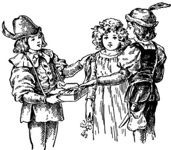
LEONTES RECEIVING FLORIZEL AND PERDITA

Camillo had long known how sorry Leontes was for that foolish madness of his, and he longed to go back to Sicily to see his old master. He now proposed that the young people should go there and claim the protection of Leontes. So they went, and the shepherd went with them, taking Perdita's jewels, her baby clothes, and the paper he had found pinned to her cloak.