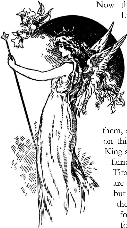
TITANIA: THE QUEEN OF THE FAIRIES

could not see that it was not poor Hermia's fault that Demetrius wished to marry her instead of his own lady, Helena. She knew that if she told Demetrius that Hermia was going, as she was, to the wood outside Athens, he would follow her, "and I can follow him, and at least I shall see him," she said to herself. So she went to him, and betrayed her friend's secret.