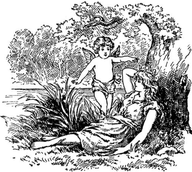
TITANIA PLACED UNDER A SPELL

"If I am wise enough to find my way out of this wood, that's enough for me," said the foolish clown.