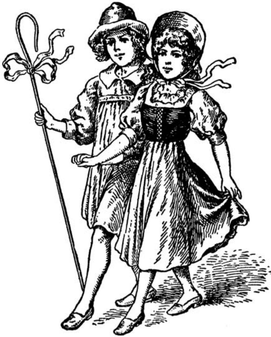
ROSALIND AND CELIA

sad at his brother's unkindness that, until he saw Rosalind, he did not care much whether he lived or died. But now the sight of the fair Rosalind gave him strength and courage, so that he did marvelously, and at last, threw Charles to such a tune, that the wrestler had to be carried off the ground. Duke Frederick was pleased with his courage, and asked his name.