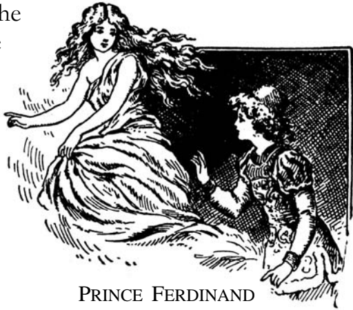
PRINCE FERDINAND SEES MIRANDA

“I might call him,” she said, “a thing divine, for nothing natural I ever saw so noble!”