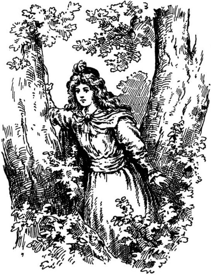
HELENA IN THE WOOD

it lion, bear, or wolf, or bull, or meddling monkey, or a busy ape.”