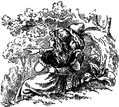
FLORIZEL AND PERDITA TALKING

Polixenes had hastened after his son to prevent his marriage with Perdita, but when he found that she was the daughter of his old friend, he was only too glad to give his consent.