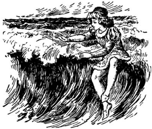
PRINCE FERDINAND IN THE SEA

knowing they were there, raised by his art a great storm, so that even the sailors on board gave themselves up for lost; and first among them all Prince Ferdinand leaped into the sea, and, as his father thought in his grief, was drowned. But Ariel brought him safe ashore; and all the rest of the crew, although they were washed overboard, were landed unhurt in different parts of the island, and the good ship herself, which they all thought had been wrecked, lay at anchor in the harbor whither Ariel had brought her.