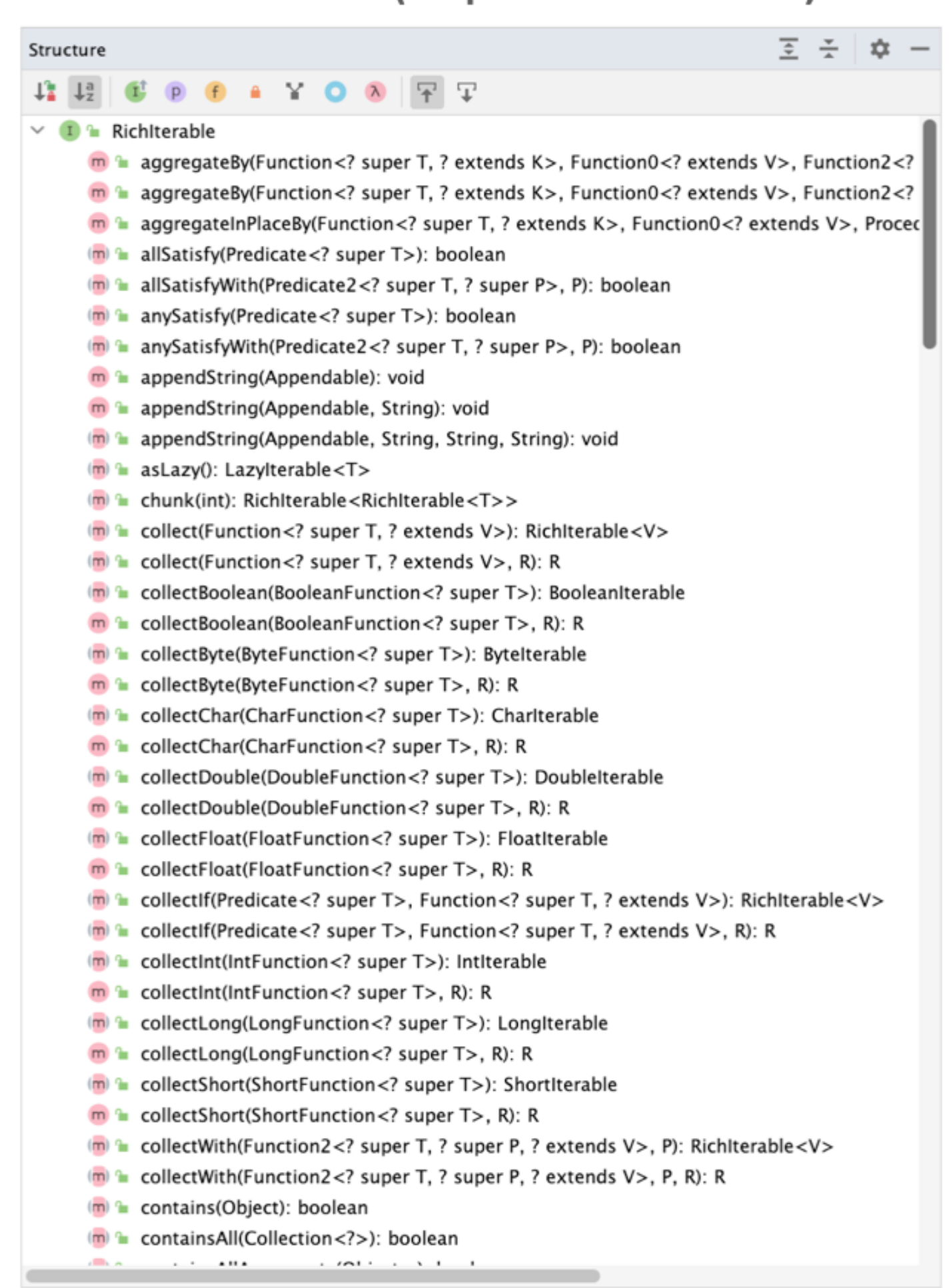
Richlterable (Eclipse Collections 12.x)