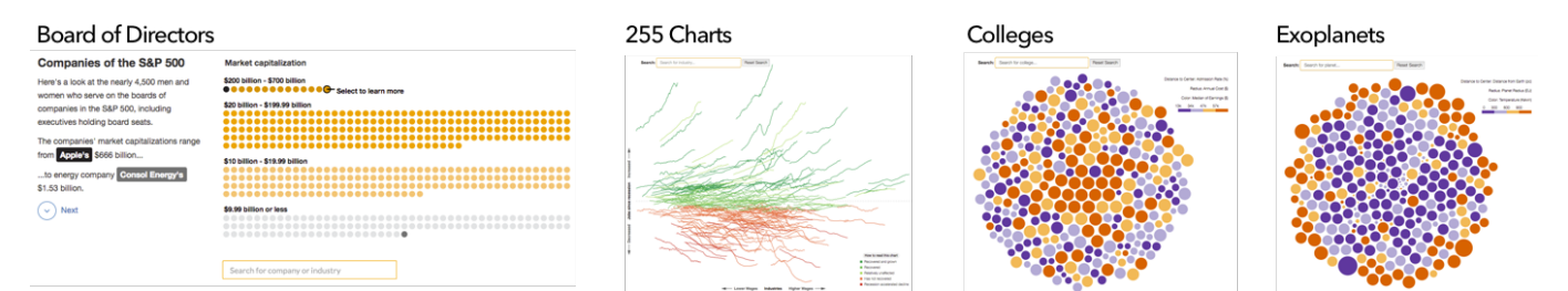
Figure 2. Experimental stimuli used to evaluate the effects of text-based search on visualization use and exploration. Each stimuli has been augmented to include search. From left to right: "Inside America's Boardrooms" from the Wall Street Journal- a multi-section visualization exploring company leaders. "How the Recession Reshaped the Economy, in 255 Charts" from The New York Times- showing how industries recovered or fell after the recent US recession. The final two visualizations are used to test specific hypotheses about the value of visualization, e.g. , whether the general familiarity of the dataset impacts the likelihood of users making use of search. (Not shown) An identical version of the third chart was also tested, with anonymized college names.